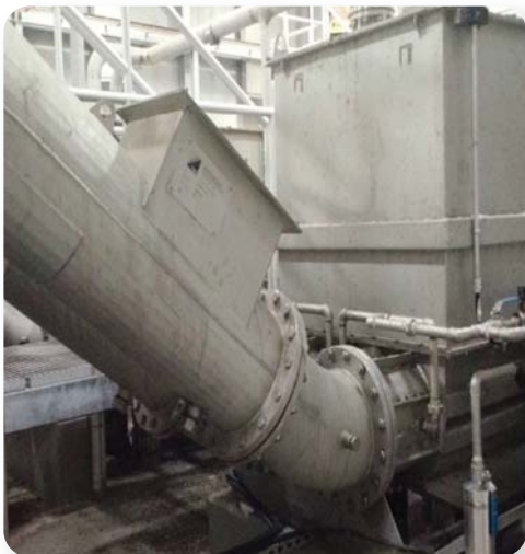
Manual Back Pressure Device Shown.