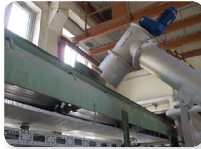
Optional Screenings Cutter