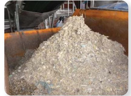
Screenings Before and After Optional Screenings Cutter.