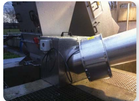
Optional freeze protection available.

Automatic – Back pressure is automatically generated by a hydraulic cylinder controlled in the main control panel. The pressure device is housed in a hatched access box which is integral to the discharge pipe.