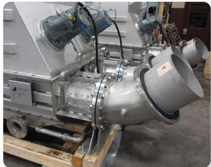
SPW 350-DM with optional impellers to increase washing function.