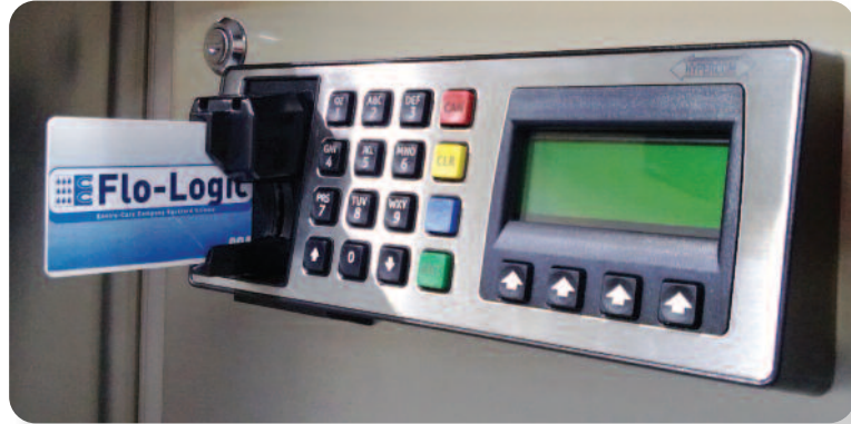
Key card activated.