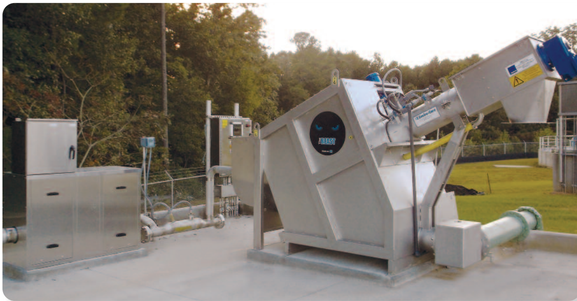
Kershaw County South Carolina BEAST Septage Receiving Station