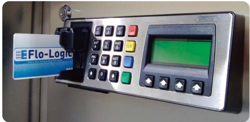
Key card activated.