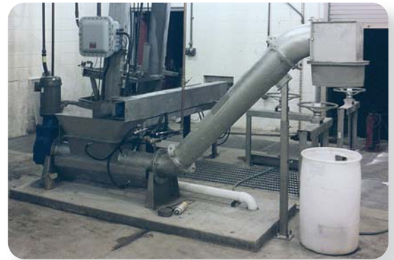
Flo-WashPress receiving screenings from an Enviro-Care Flo-Screen