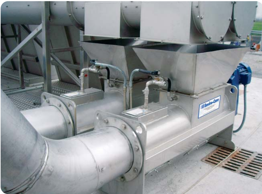
Two Flo-WashPress units receiving screenings from a conveyor system.

The Flo-WashPress Shafted Washer Compactor incorporates screenings washing and dewatering in a single unit. The clean, dewatered screenings can then be discharged into a dumpster or an optional continuous bagger for ease of handling and disposal.