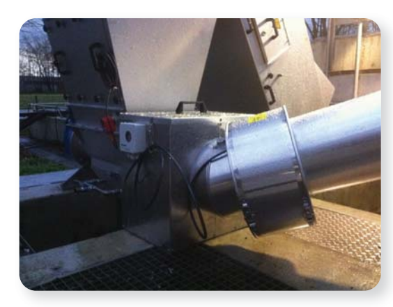
Optional freeze protection available.

Automatic – Back pressure is automatically generated by a hydraulic cylinder controlled in the main control panel. The pressure device is housed in a hatched access box which is integral to the discharge pipe.