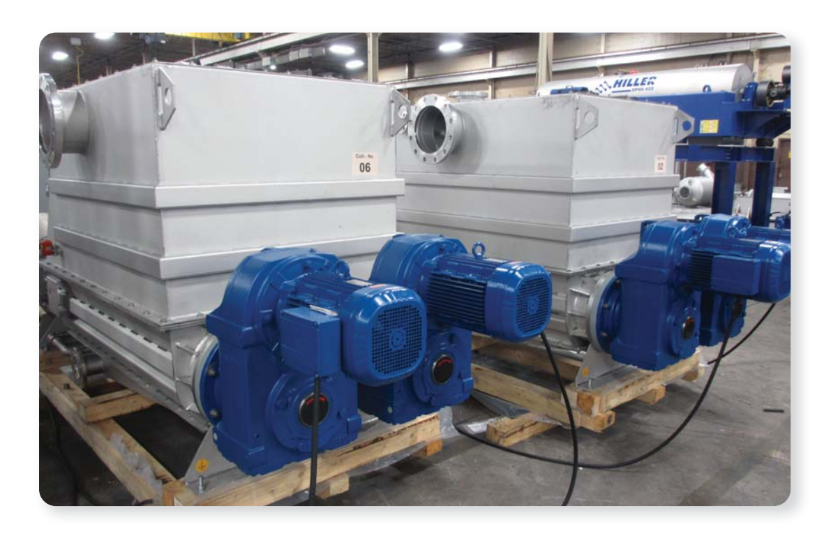
This innovative wash press design has two wash press units side by side in a single press body. One inlet feeds the two wash press units. This SPW350-D can wash and dewater 700 cfh.