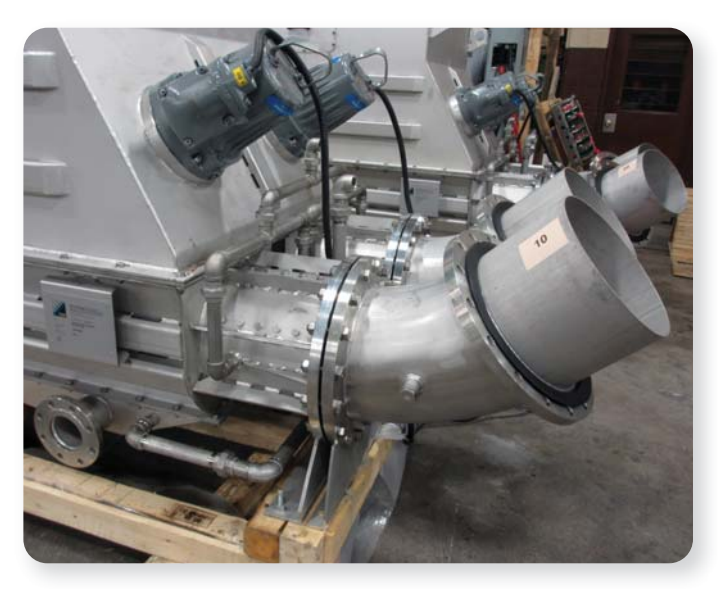
SPW 350-DM with optional impellers to increase washing function.