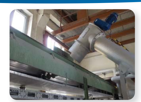
Optional Screenings Cutter