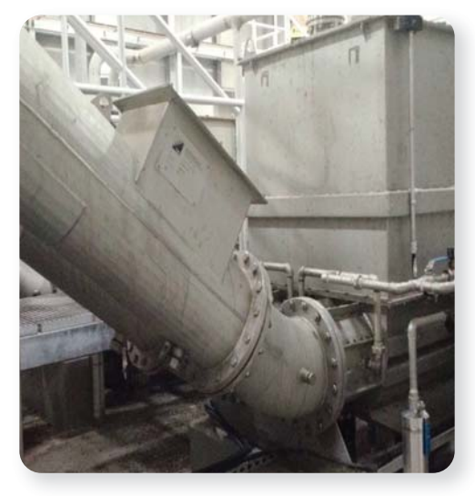
Manual Back Pressure Device Shown.