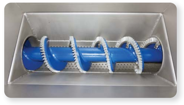
Fully Welded Hardox Shafted Spiral.