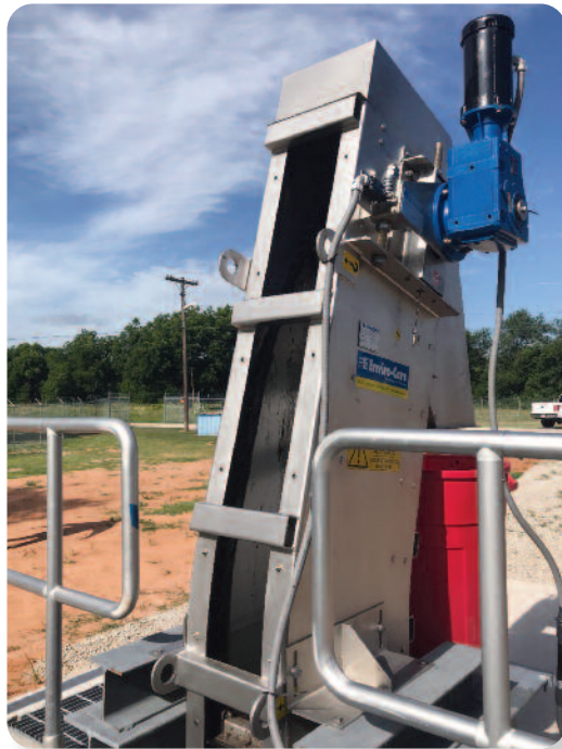
SAVI® MultiRake Perf Vertical Screen.