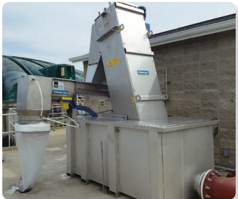
Fish Creek WI In Tank Unit Feeding a SPECO® Conveying Compactor.

The unit is equipped with lower chain return guides in order to maintain proper alignment and engagement of the cleaning mechanisms with the perforated panel. A mechanical scraper assembly removes the debris from the cleaning mechanisms and deposits this material into a discharge chute.